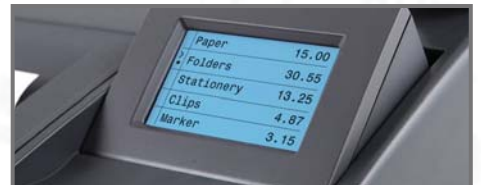
SCROLLABLE LCD DISPLAY