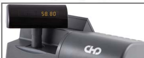
CLEAR LED CUSTOMER DISPLAY