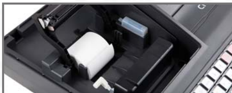
EASY PAPER LOAD