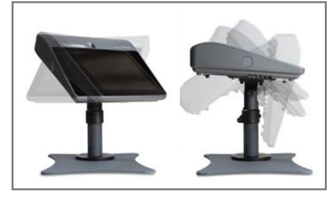
CUSTOMER DISPLAY, 240 x 48 dot