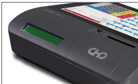
CUSTOMER DISPLAY, 240 x 48 dot